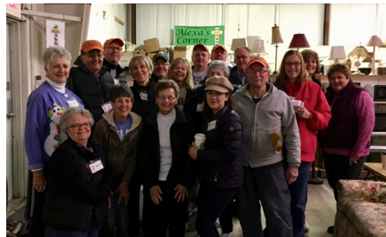
Selection Saturday Volunteers

The EFM is very blessed to have a cadre of very faithful and dedicated volunteers. About 75 volunteer positions per month are required to operate the ministry and the volunteers donated over 3,900 hours in 2017. The furniture acquisition function requires 29 volunteer positions, intake and agency relations 6, warehousing 20, and furniture distribution 20. The ministry's smooth operation is directly attributable to these volunteers and when asked to do a little more, they always do.