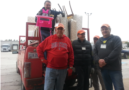
Volunteers Loading Family's truck

The EFM volunteers are dedicated individuals who are filled with compassion for helping those in need. Lifting furniture, sorting goods, and loading trucks is hard work but no one ever complains. Most volunteers can't believe the fun they are having doing God's work.