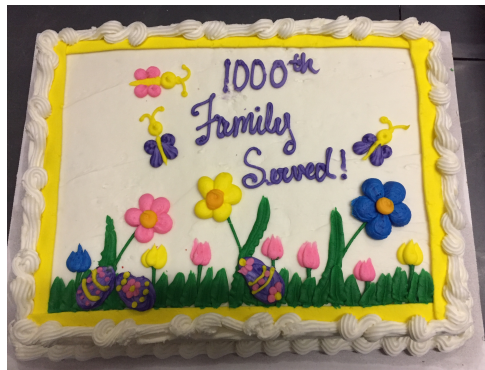
A sweet treat shared with April participants and volunteers

In April the ministry reached a major service milestone – the 1,000 th family received furniture.